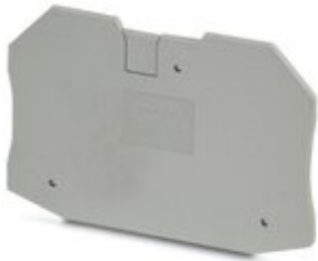
Cover, width: 2.2 mm, color: gray

Please be informed that the data shown in this PDF Document is generated from our Online Catalog. Please find the complete data in the user's documentation. Our General Terms of Use for Downloads are valid ( http://phoenixcontact.com/download )